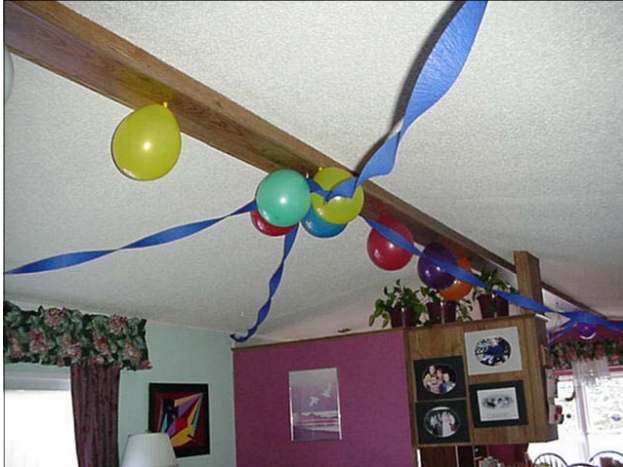
Balloons and streamers add a festive cheer to mark the day.